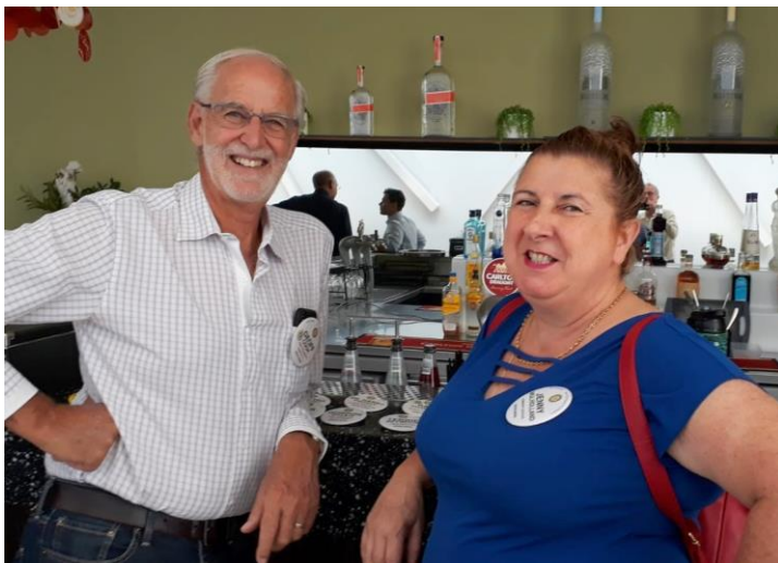
Meeting at the Bar