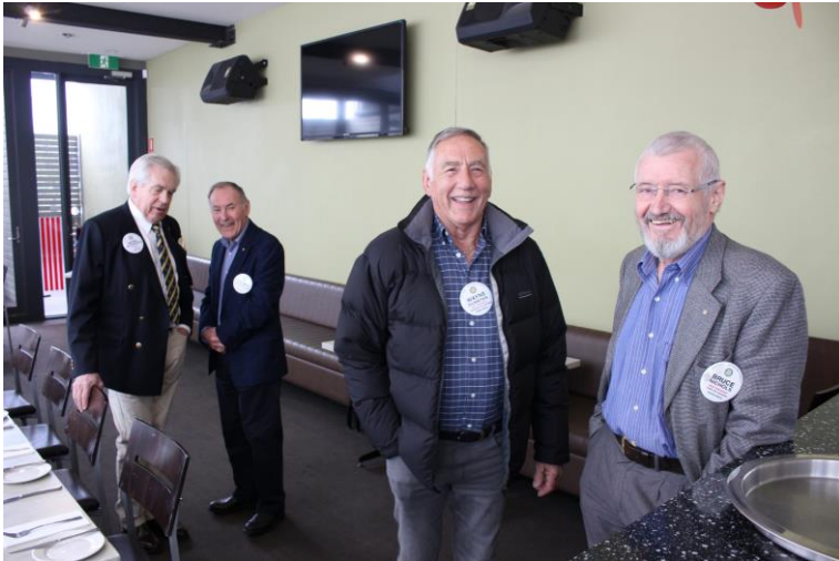
What's the joke?

27 May - Evening Meeting 6.00 for 6.30pm