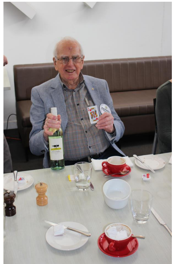
King of Hearts !