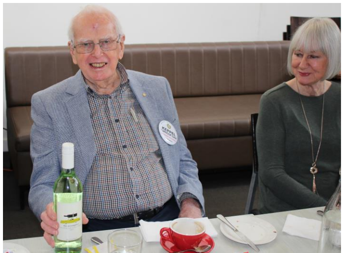
Keppel's Cellar gets a boost